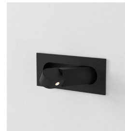
CODE: 1323022 FINISH: MATT BLACK

TO MAINTAIN THIS PRODUCT TO ITS BEST CONDITION, PLEASE VIEW OUR CARE AND CLEANING GUIDE ON THE SUPPORT SECTION OF THE ASTRO WEBSITE.