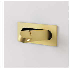
CODE: 1323013 FINISH: MATT GOLD