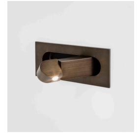
CODE: 1323011 FINISH: BRONZE